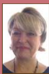
Printing and Records Sheenagh