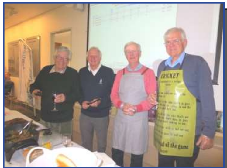
Our Sizzling Helpers