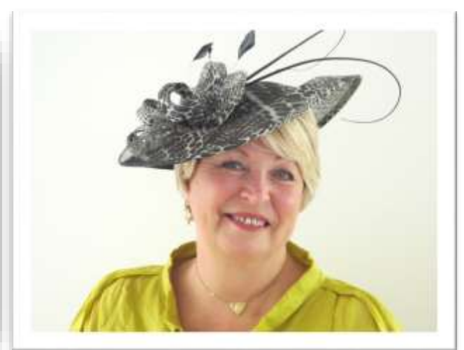
And the Phantom Hat Stealer