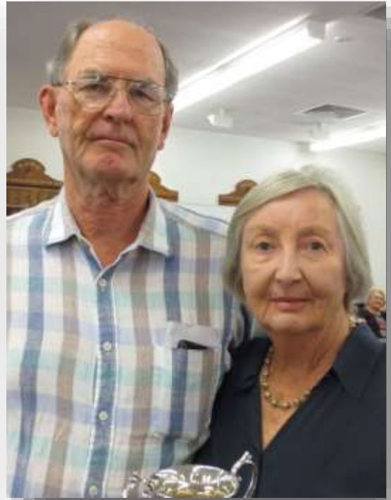
Evening Pairs Champions: Firstenberg Cup