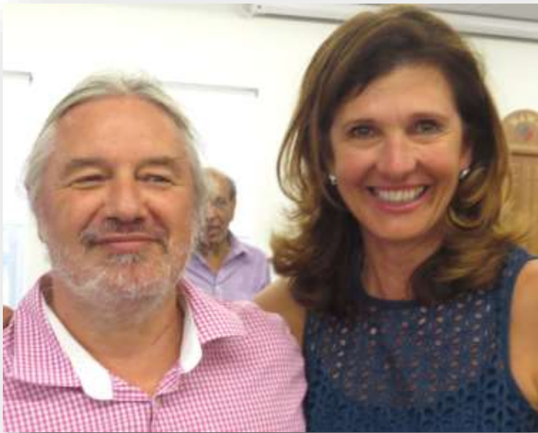
Mixed Pairs Champions: Valli Katz Shield