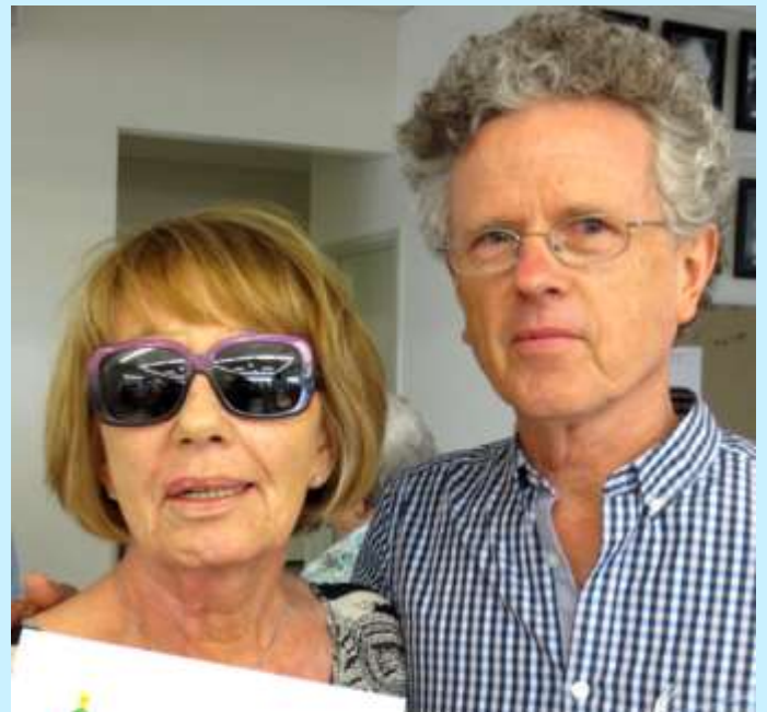
Friday Pairs Winners NS: