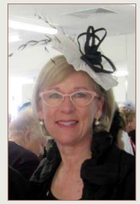
11.00 am LUNCH 1.00 pm BRIDGE

PLAN YOUR HAT AND GET YOUR ENTRY IN NOW.