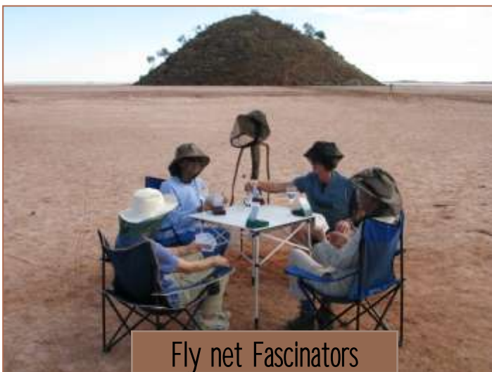
Fly net Fascinators