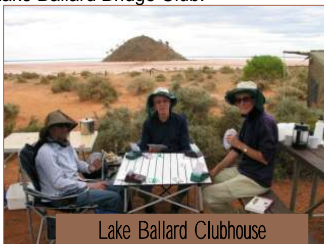
Lake Ballard Clubhouse

West relishing the prospect of a big score led the A ♥ which was trumped by South. South played a small ♠ towards dummy, taken by West's singleton Ace. West was now in a quandary and led the K ♦ which was taken by the A ♦ in dummy. The K ♠ accounted for the Q ♠ – the last outstanding trump. A diamond was then ruffed by South. A club led and ruffed. A diamond ruffed in South's hand. Finally a club ruffed in North's hand. The rest of the diamonds in North's hand had now been established — South making his small slam on a Yarborough! Strange bridge hands such as the one above can be experienced by visiting the Lake Ballard Bridge Club.