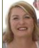
Printing and Records

the Committee members and other Club members who produce them is huge. I believe it is essential that conveners for these events should be encouraged and expected to hire outside people to help with important functions such as catering and cleaning. This may lead to increased costs but the increased numbers increase revenue which should cover these costs. I think it is important that such functions are revenue-neutral, which means no function or event is subsidized by the club, or by the efforts of the few who produce them. Finally, on behalf of the editorial team I would like to wish all members a happy Christmas and a glorious new year, with many more great games of bridge to come.